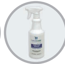
Just For Spots