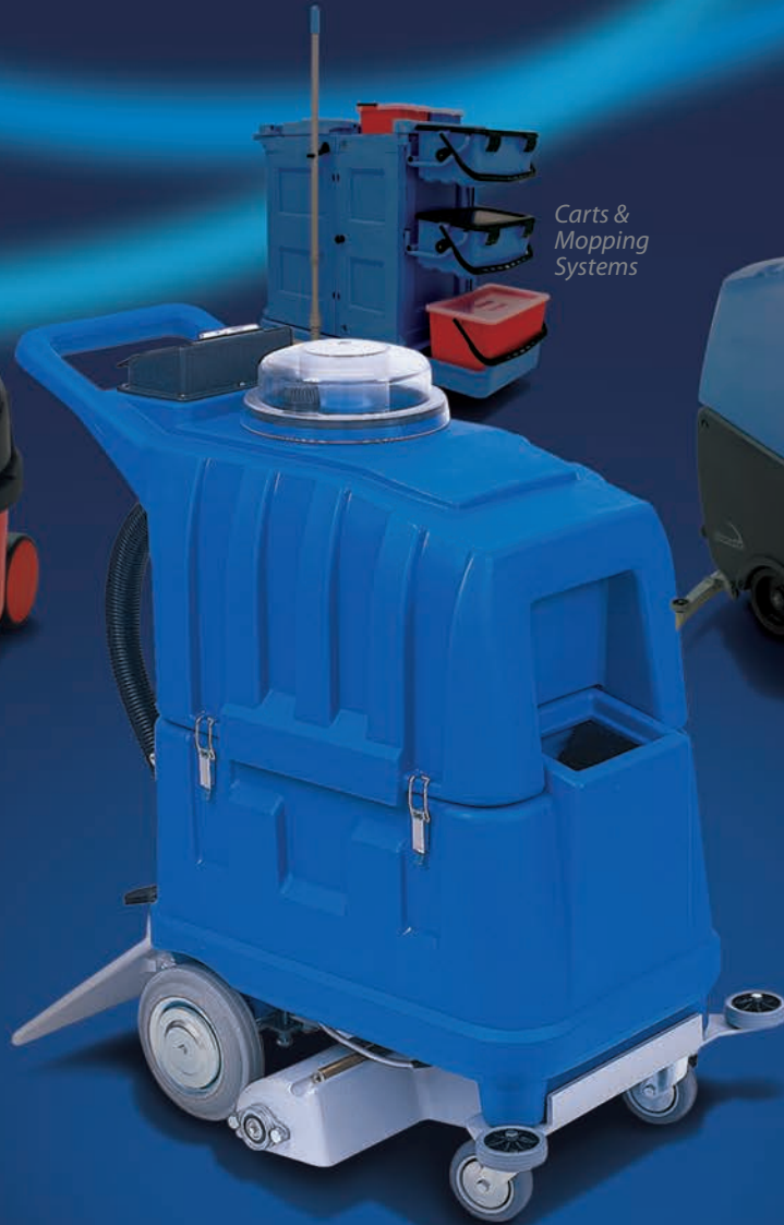
Carts & Mopping Systems