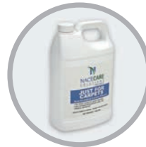
Just For Carpets