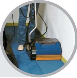
Clean right to the edge of walls