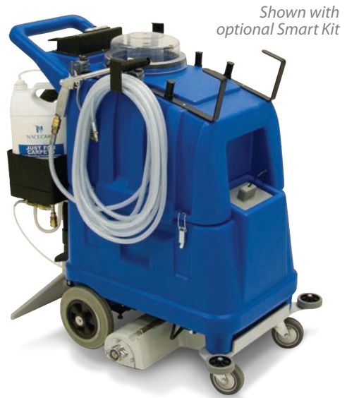
Shown with optional Smart Kit

Simply remove the carpet shoe, fit the squeegee attachment and lower the brush housing to the lowest position to enable cleaning of your hard floor surfaces.