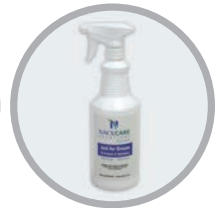
Just For Grease