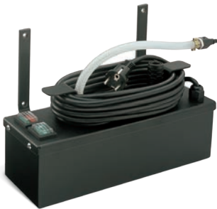
HT 1800 Heater