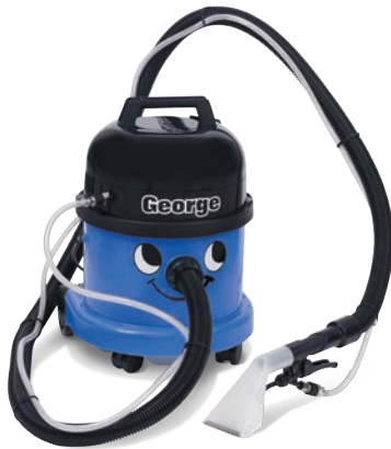
GVE 370 "George"

The TP 4X has 120" of waterlift making it excellent for carpet spotting and upholstery cleaning. It has a 60 psi pump and comes with an 8' solution/vacuum hose and hand tool, an optional extraction wand and cart are also available.