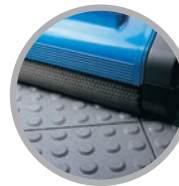
Profiled Rubber and Ceramic