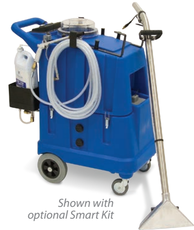
Shown with optional Smart Kit