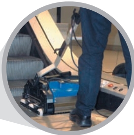
Optional escalator kit for the DP 420