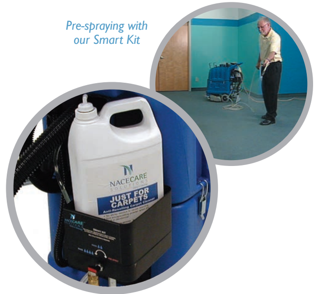
Pre-spraying with our Smart Kit

Just for Spots is a water-based general spotter formulated to remove 90 percent of most spots in carpets. This ready-to-use, 32 oz. bottle is safe to use for general spot cleaning without harming carpet fibers or causing re-soiling. Simply apply onto a spot and blot with a white terry cloth towel or remove with a spotting machine or extractor.